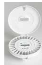
Automatic Pill Dispenser

The monitoring centre will then follow the procedure agreed with the family. For example, if someone wearing a Falls Sensor, falls to the ground and doesn't get up this will activate the monitoring centre to contact the person at home to check they are ok, and/or telephone the nominated contacts.