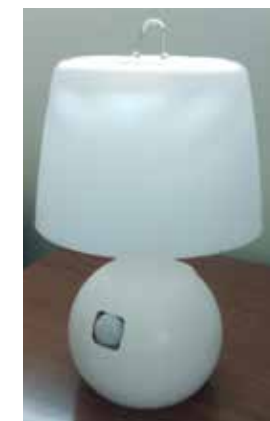
Motion Sensor Lamp