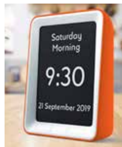
Calendar Flip Clock